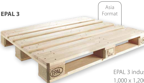
EPAL 3 industrial pallet 1,000 x 1,200 mm