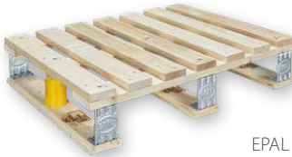
EPAL 7 half pallet 800 x 600 mm