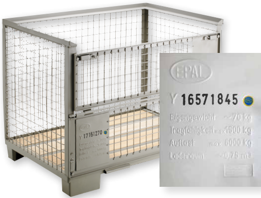
EPAL box pallet 1,200 x 800 mm