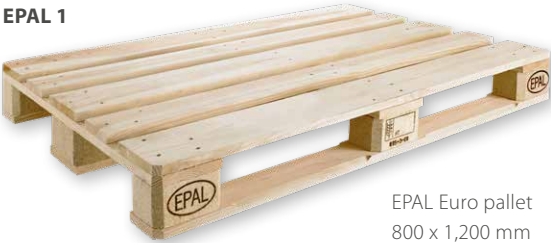
EPAL Euro pallet 800 x 1,200 mm