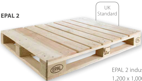
EPAL 2 industrial pallet 1,200 x 1,000 mm